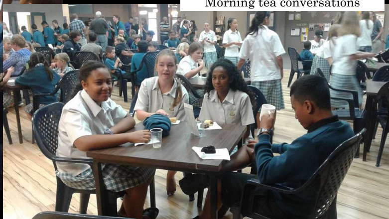
Morning tea conversations